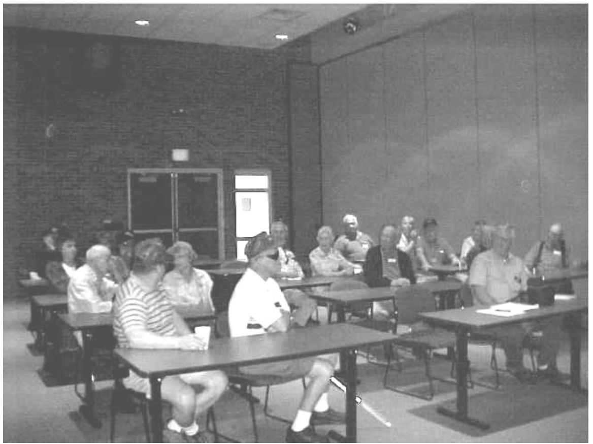
THE CROWD TAKES IN ALL THE ACTION