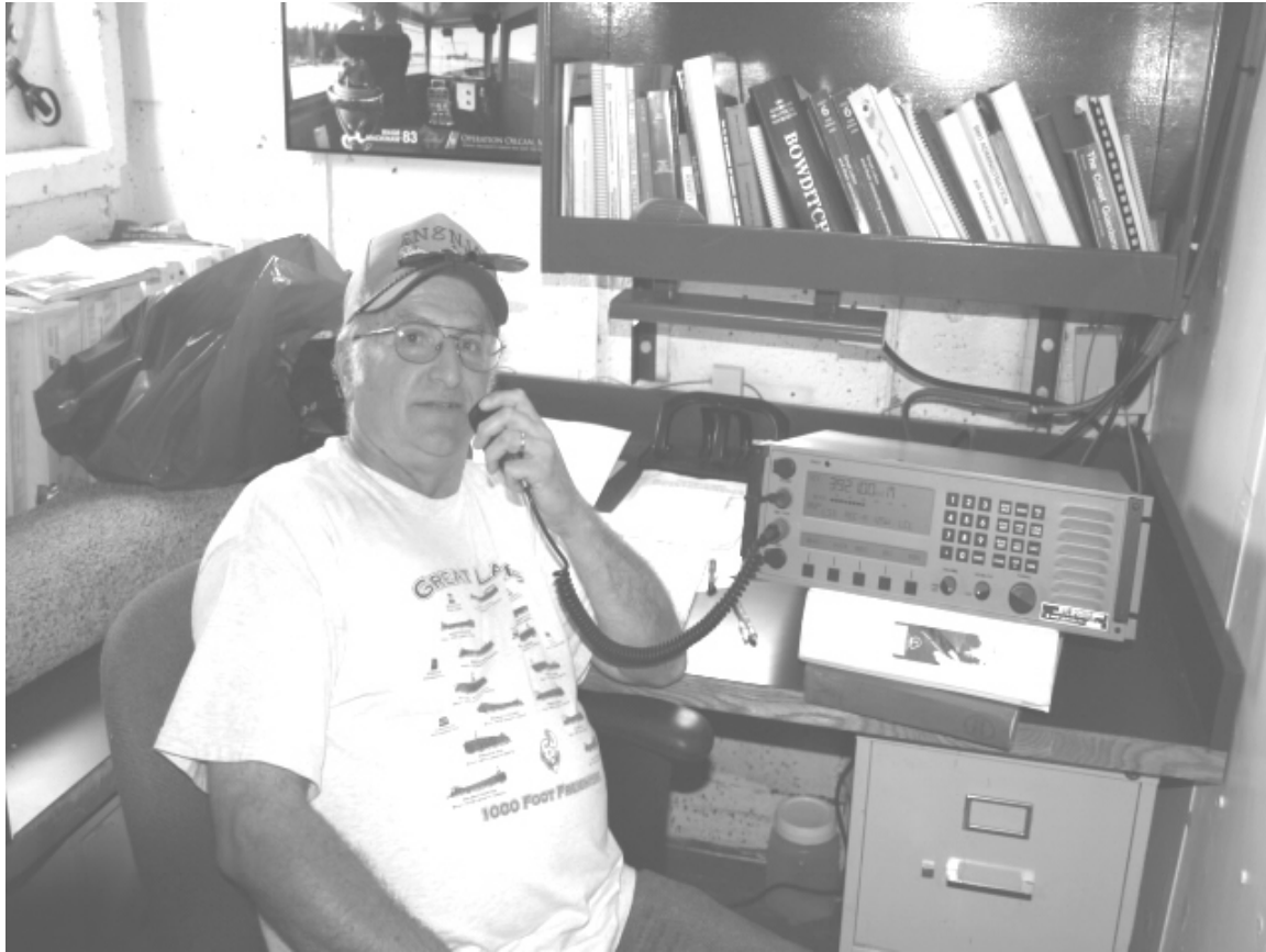
BILL, N8NJA RUNS THE NET